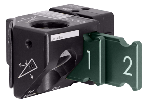
LBP2-SAM mounted on an LBP2 laser beam profiler